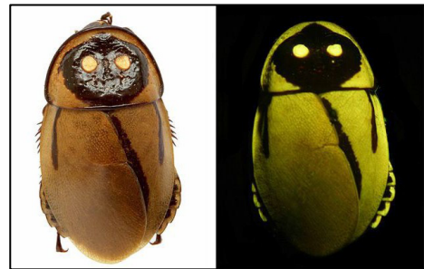
Glow-in-the-Dark Roaches

Cockroaches thrived on earth roughly 80 million years before the dinosaurs—proof of their adaptability and strength. Later, they evolved in partnership with mammals, serving as "janitors" in an interdependent relationship. From the nests of mammals, cockroaches consume a variety of food scraps, mold, mildew, and eggs of lice and fleas, in return leaving a cleaner habitat (Wojcik, 2009).