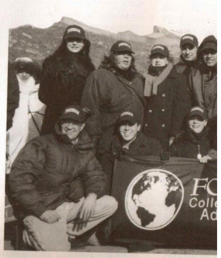
▲ Business Students Sold on China — Last semes tion embarked on the first Fordham trip to China. Althor Kong, these students also had plenty of time to see the Shanghai, the group met with executives at the advertis marketing familiar products to Chinese college students Perhaps their most memorable time was spent at an inwhere Buddhist monks absolved their first 108 worries

Currently, most research is faculty-oriented, that is students help faculty on their research projects. With FIRST, most research will be student-oriented, or projects conceived solely by the student.